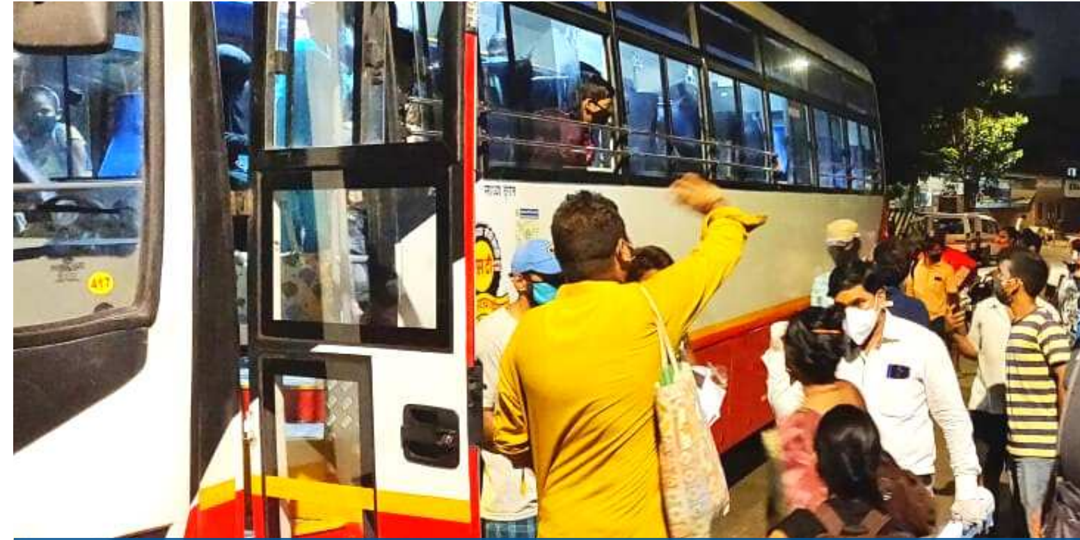
GET PEOPLE HOME